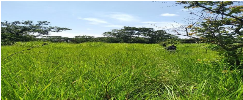
Ahkom Lei agriculture project site

A further important engagement of the project will be the Academy's commitment to agricultural science. Food, arguably, is the most important of man's basic needs. For this reason, the Ahkom school farm project was evolved as a prominent activity of A+ Academy. Which is why in addition to the 15 acres school farm land at Boroma, Ahkom has acquired an additional 100+ acres in the Lei chieftdom for its expanded agricultural activities.