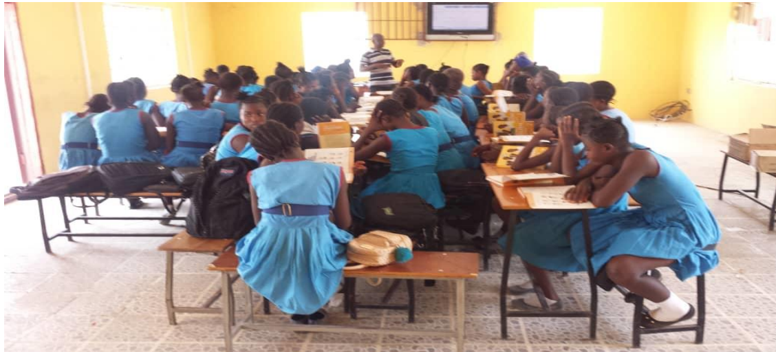
Ahkom facilitated RTR class at UMC Girls secondary JSS3, Kono

The program is well proven. It was initially launched by English Helper in India in 2013 and now reaches over 12 million school pupils and wider community learners in India, Africa and the Americas. Large scale studies have shown that pupils achieve 20-50% improvement over a school year in their English reading and comprehension when exposed to RightToRead classes, compared to a controlled set of peers. The Kono program has been extended to 6 other schools one of which is in the capital, Freetown.