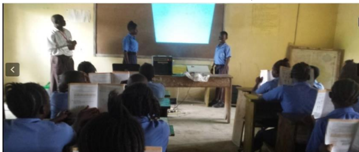
RTR class at Ahkom Grammar School JSS1, Kono