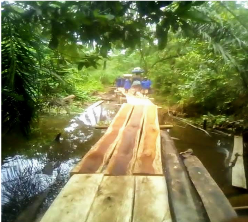
Part of forest portion at Lei farm

Currently our only access to Lei farm and for school children from several villages beyond. It floods over when the rains are really bad and younger children have to stay at home