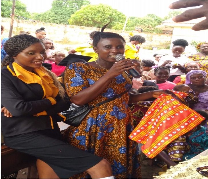
Happy graduation day at the Tech Voc